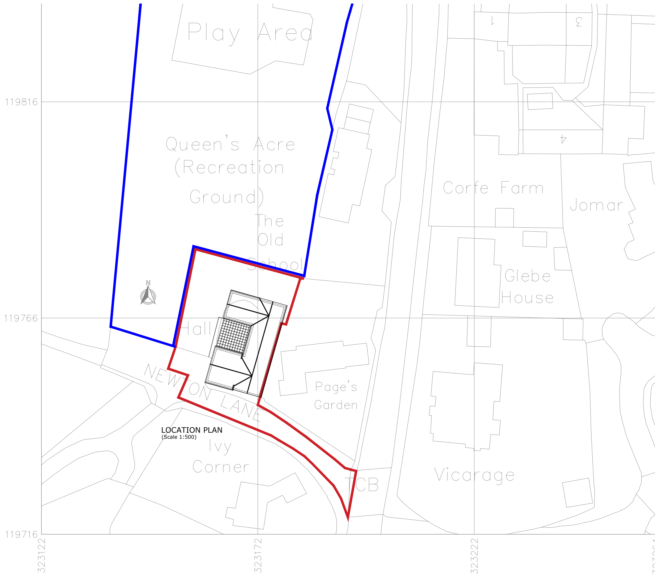
LOCATION PLAN (Scale 1:500)